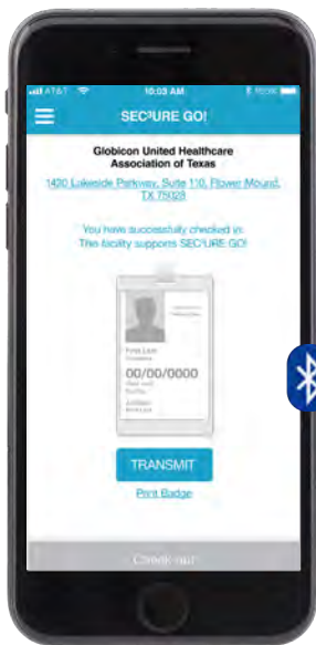
Check in on the SEC 3 URE Mobile App.