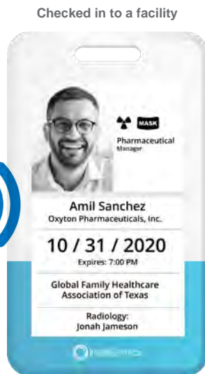
Transfer your visit details to SEC 3 URE GO!